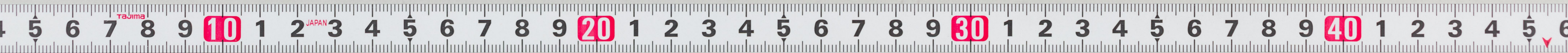
岩崎家文書移民関係資料 資料番号 679

Handwritten Japanese text on a red paper slip. The text is written vertically in cursive (sōsho) style. The most prominent characters in the center are "中" (middle), "下" (bottom), "ノ" (possessive particle), and "乙" (bottom character), which together read "中下ノ乙" (Nakagata no Ochi). To the left of this central text, there are several lines of smaller, fainter characters, likely providing additional details or a signature.